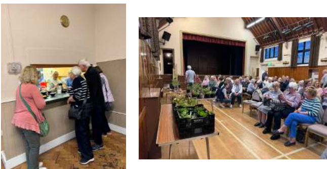
The refreshments team doing a fantastic job as always!

More details on the talk can be found at: grayshottgardeners.net/