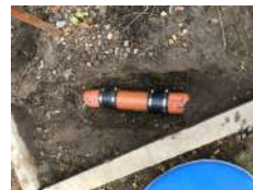
During - whoops!